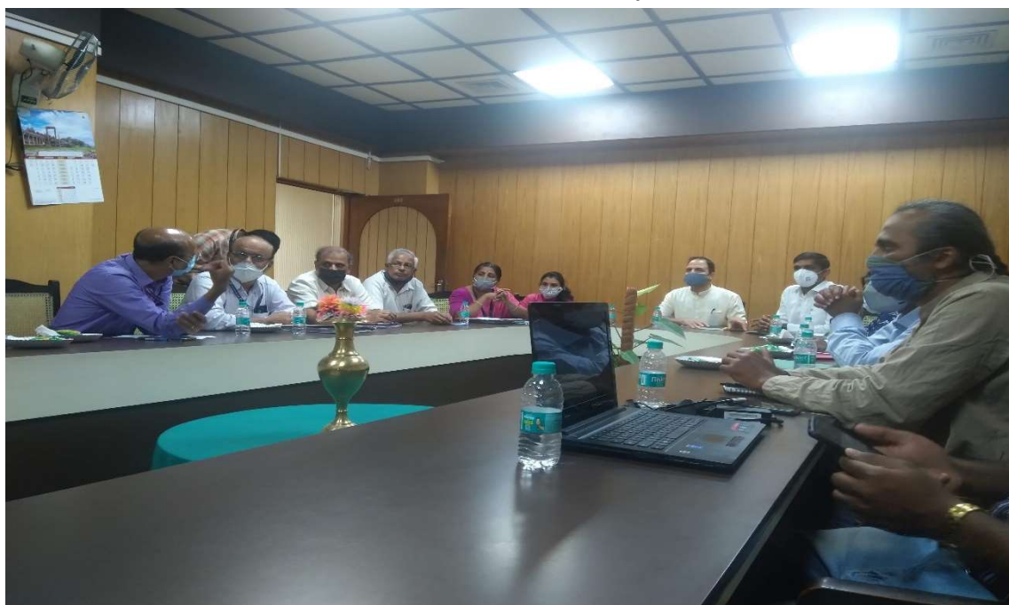
Digital Dialogue with Agriculture department